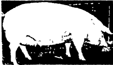
"THE GREAT WHITE BREED"