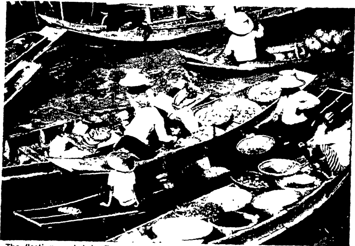
The floating market in Bangkok is a sharp contrast to the many markets in