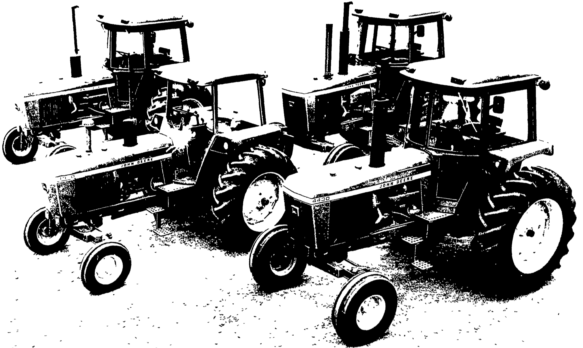
New John Deere Sound-Idea tractors: front row, left to right; the 80 hp 4030 and the 125-hp 4430. Back row, left to right; the 100-hp 4230 and the 150-hp 4630. The 4030 is pictured with the new 4-post Roll-Gard, which is an integral part of the Sound-Gard Body shown on the other three models. Sound-Gard Body is also available for the 4030.