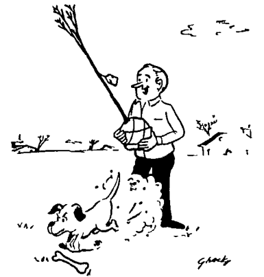
"...another couple inches..."

the Lehigh University Alumni Association, and the Associated Pennsylvania Constructors. He serves on the Board of Trustees of Lehigh University.