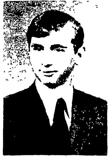
James Charles Manor FFA Chapter

program after graduation. His goal is to become established in dairy farming.