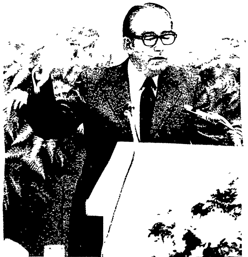
Richard E. Lyng, assistant secretary of agriculture for the U.S., spoke in November at the annual Chamber of Commerce agriculture-industry banquet.