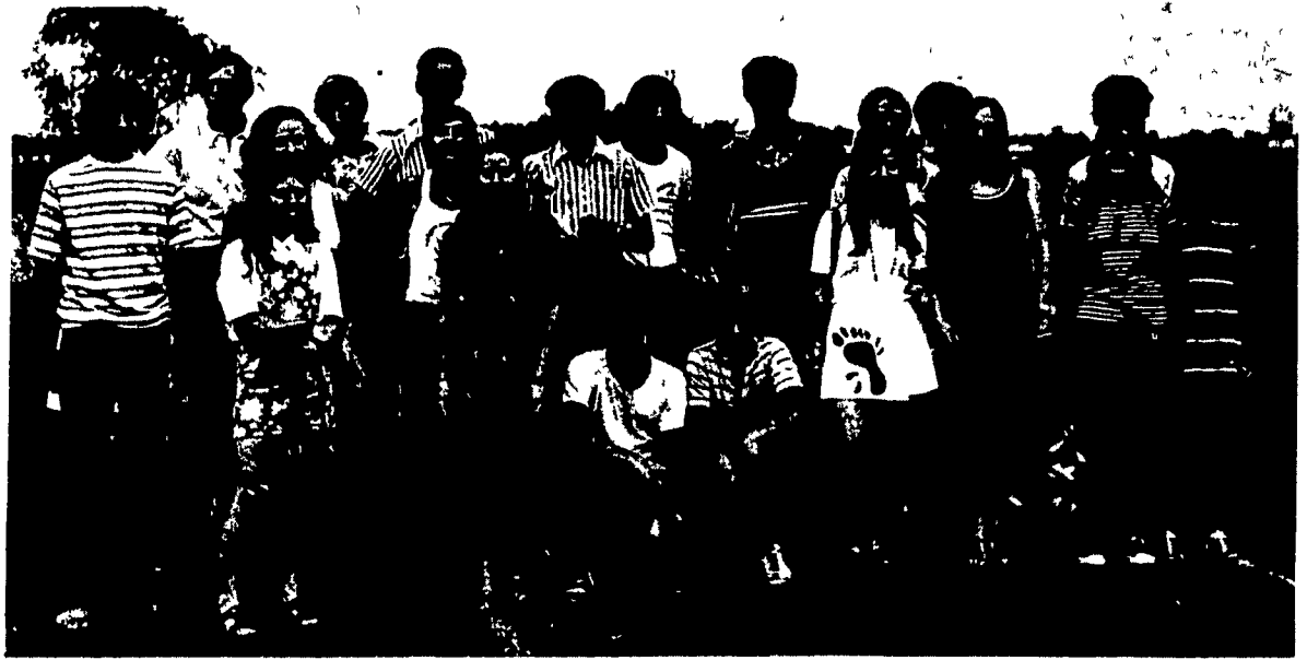
Lancaster County 4-H'ers played host to 4-H delegations from Michigan and North Carolina in July. Ten youngsters