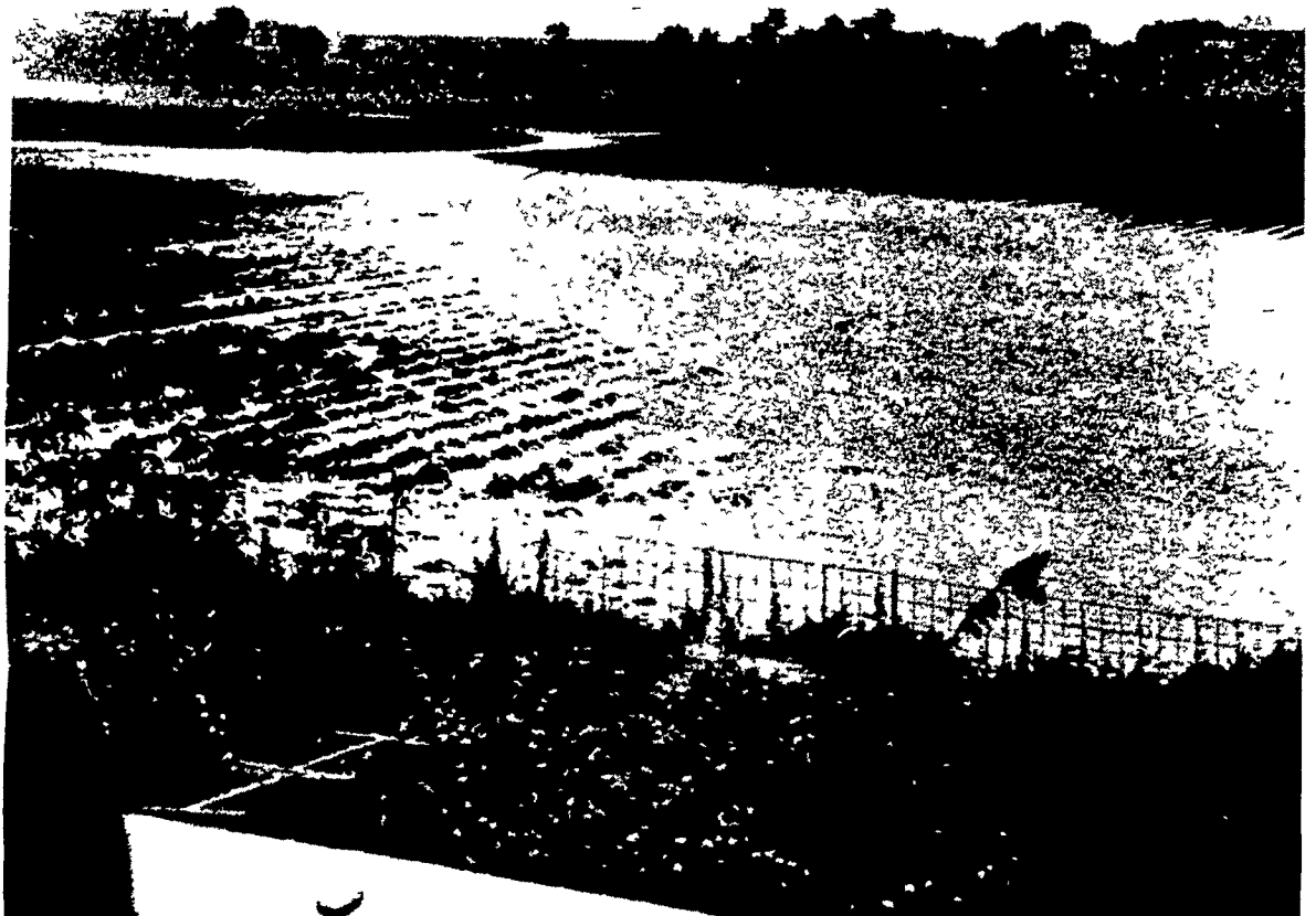
Tropical storm Agnes covered the county with water in June.