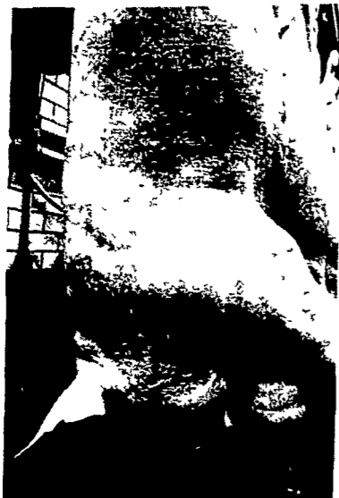
As the tattooed carcass moves through the scalding and dehairing processes, the tattoo numbers remain clearly legible on the skin.

APHIS officials say that the rapid movement of animals through commercial marketing channels these days makes it essential to locate and eradicate sources of disease as rapidly as possible. Thus, the nationwide