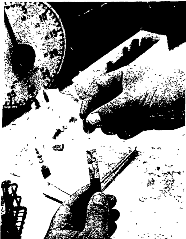
During carcass inspection, samples of blood and tissue are taken for brucellosis and tuberculosis testing. If lesions of tuberculosis are found in tissue samples or if blood samples test positive for brucellosis, the diseased hog can be traced back to the farmer using the recorded tattoo number.

use of the tattoo system would be a major step toward the eradication of such diseases of swine as tuberculosis, brucellosis and trichinosis.