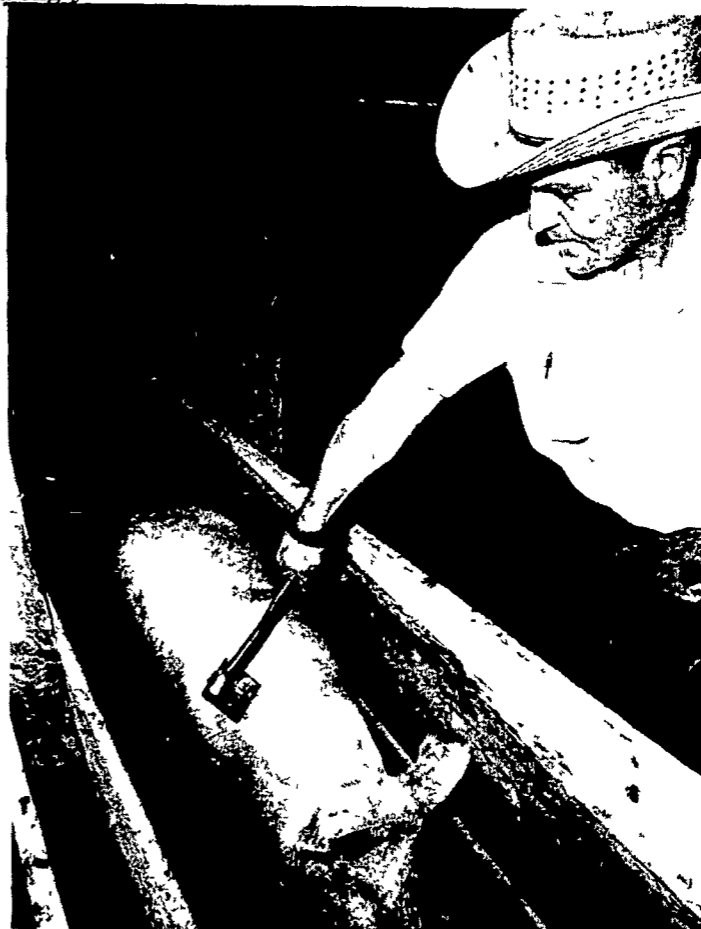
Swine identification tattoos are applied to the shoulder of the hog. Here, a stockyard worker tattoos a hog during tests conducted of a USDA-proposed swine identification system. These tests were held recently at four terminal markets. Preliminary reports of results indicate that use of the system will allow successful traceback of diseased animals to the herd of origin — a great asset in keeping swine free of disease.

Animal health officials are hopeful that nationwide acceptance of the system will be a benchmark in achieving eradication of some of the major swine diseases that now plague U.S. hog production.