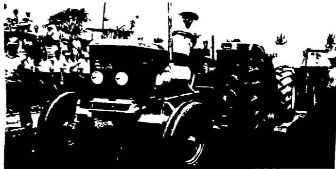
Amos Stauffer driving a DEUTZ D100 06 to another victory at a local tractor pulling contest. On September 16, 1972 DEUTZ and STAUFFER DIESEL INC had 14 winners out of 19 entries at R & F Tractor Pull in Kinzer, Pa.