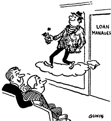
"See, not to worry-he apparently got his..."