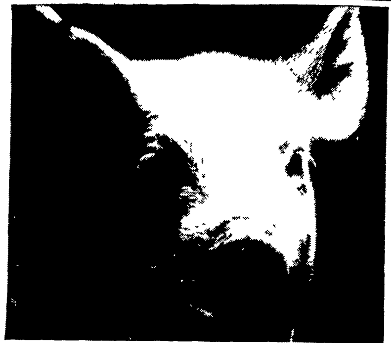
This week-old pig's stomach is exactly this size. The little dry feed it takes to fill this tiny "fuel tank" must be LOADED WITH POWER!