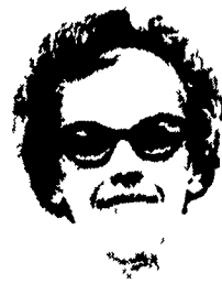
By Doris Thomas, Extension Home Economist

Use Eggs for Economy According to an old wives legend, the secret of easy-to-peel hard-cooked eggs is a pinch of salt in the cooking water. The salt supposedly solidified the shells, making them easier to remove. The U.S. Department of Agriculture, however, recommends a watchful eye during cooking as the best approach to both easy-to-peel and better tasting hard-cooked eggs.