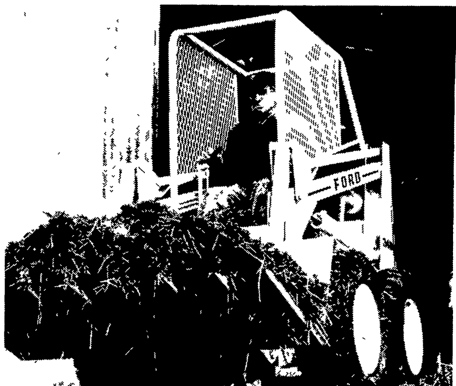
Ford 340 compact loader.

Measure tonnage moved each hour and the Ford 340 compact sizes up as a giant. In tight quarters, its great maneuverability will often let you load out several 1,500-lb loads while a big tractor-mounted rig would be struggling to get the first bucketful. And you'll save hours of hand labor by using the agile Ford 340 to clean up aisles, stalls, pens and corners where the big outfits simply cannot go.