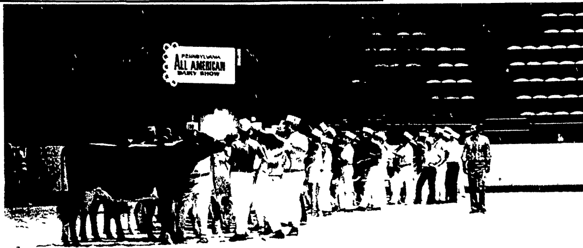
This was the senior yearling judging at the Pennsylvania State Holstein Show held last Saturday in Harrisburg. Local cows