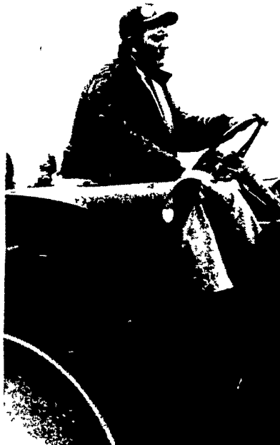
Fierce concentration was one of the requirements for the tractor driving contest at the Solanco Fair. The contest was held Thursday afternoon.