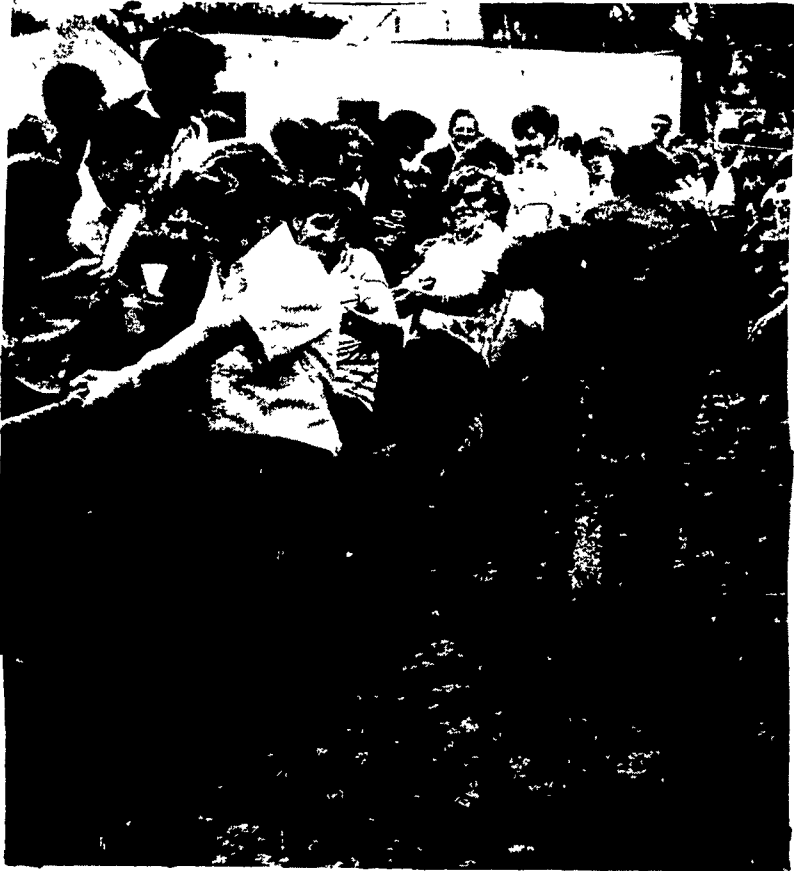
Cries of "Heave! Heave!" and "Pull! Pull!" rang out as FFA teams from throughout Lancaster County competed for the tug-o'-war championship Thursday afternoon at the Solanco Fair. The day's toughest tuggers proved to be the hometown Solanco team.