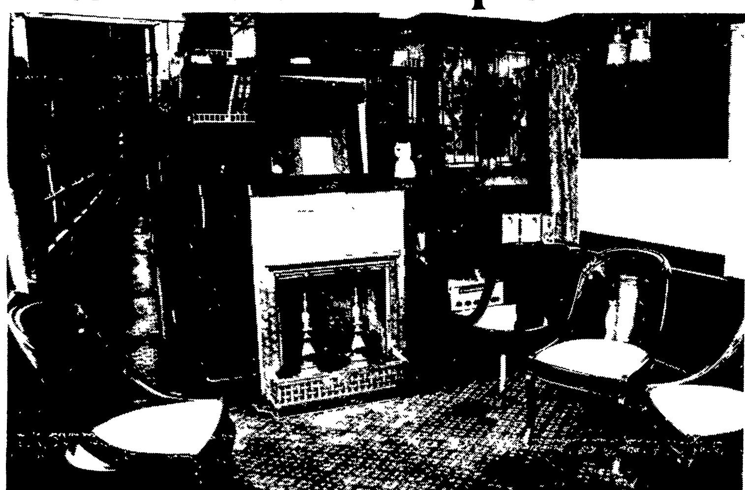
The plush, exclusive Eisenhower railroad car, used for Presidential campaigning and other First Family travels. Interior view of the airconditioned car shows living room (done in cherry wood) with fireplace (bronze front, gold trim) and elegant chairs and carpeting. The car is located at St. Peters Village, an old restored Victorian village just off Rt. 23, near Knauertown, in northern Chester County.