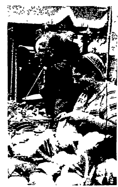
Stands at Root's were loaded on Tuesday with homegrown produce.

The interior of the new main building at Root's Country Market and Auction is expected to be filled with standholders and customers in the next three to four weeks.