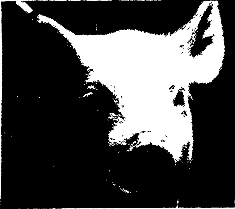
This week-old pig's stomach is exactly this size. The little dry feed it takes to fill this tiny "fuel tank" must be LOADED WITH POWER!

The Kentucky cases were the first found in that State since December 10, 1969. The first outbreak in the intervening 31 months was confirmed on Aug. 21, when a case was diagnosed in Breckenridge county. This was followed closely by confirmation of a case in Hardin county on