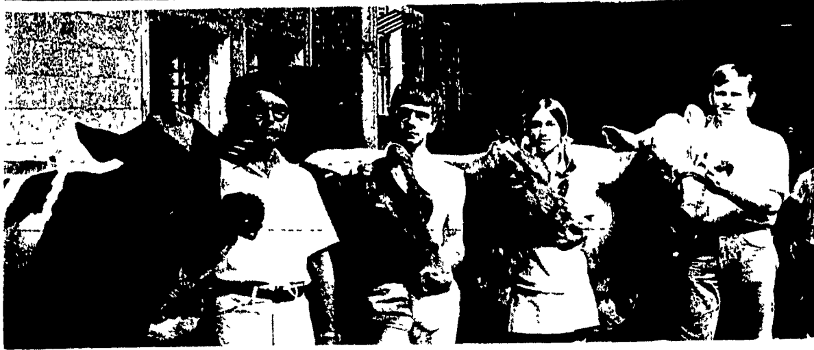
Four Lancaster County Guernseys took first place county group honors at Tuesday's District 4-H Dairy Show. Shown with their cows are, from left to right: