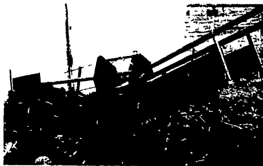
Regular Bunk Feeder Paddle 22 1/2" long 3 1/2" high

The paddles and runners is a combination which is patent. These are so designed that they can be used on either side to push any direction. No left or right they fit both sides.