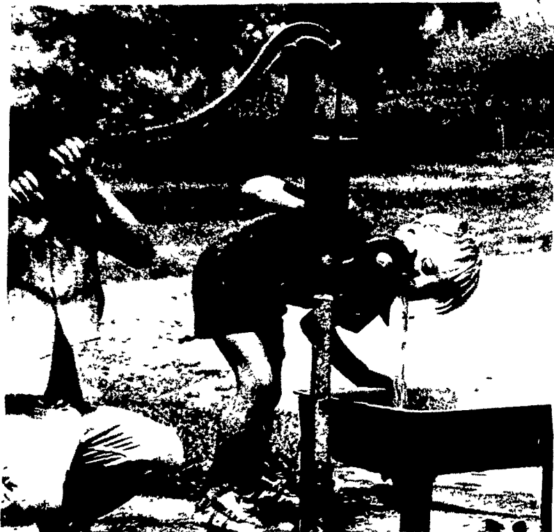
Two boys plus one pump equals one satisfying, if sloppy, drink. The you-pump-while-I-drink was repeated many times Wednesday during an Extension Nutrition Education 4-H day camp at Lancaster's Buchmiller park. Over 170 youngsters attended from many different parts of the county.