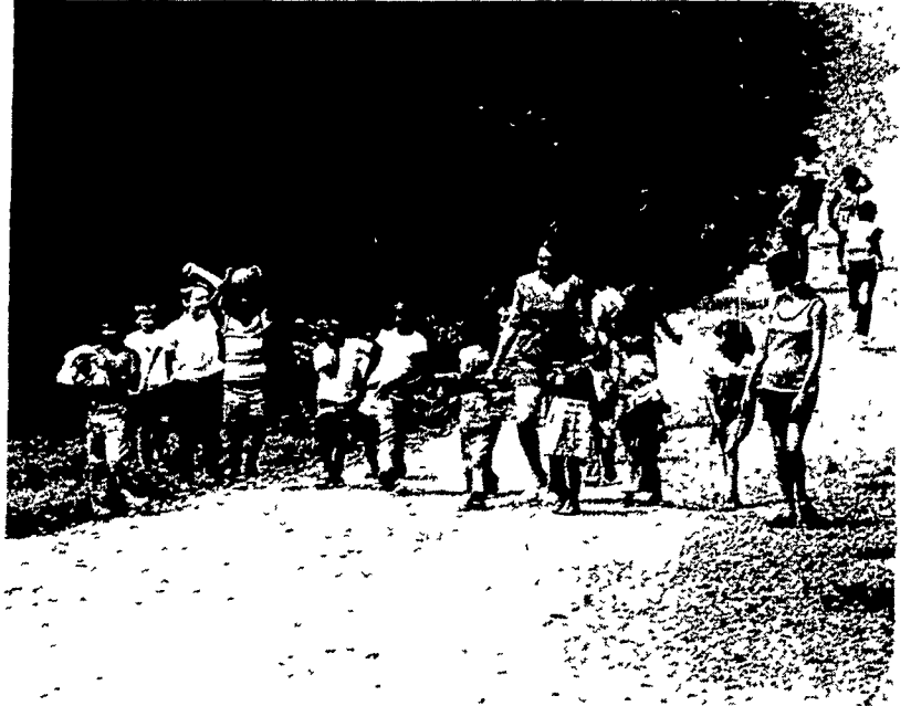
Volunteer leaders helped entertain and train over 170 young children during Wednesday's Extension Education Nutrition day camp at Lancaster's Buchmiller Park. All the children are enrolled in ENE 4-H groups.

A park full of kids calls for just about half a park full of adults. A number of mothers in the ENE program were on hand, along with teen volunteers both from the 4-H County Council and from the ENE 4-H program.