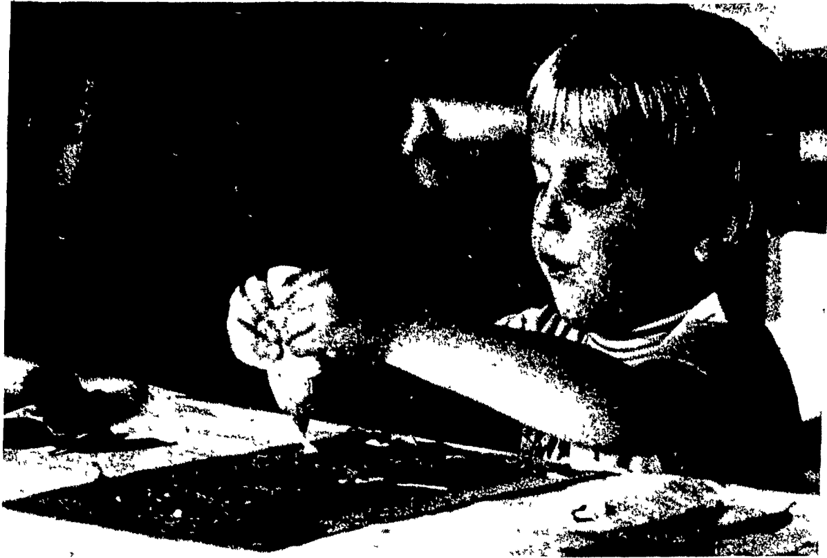
An arts and crafts table at the ENE 4-H day camp in Buchmiller park saw a good many youngsters preparing nature exhibits

with leaves, construction paper and lots and lots of glue.