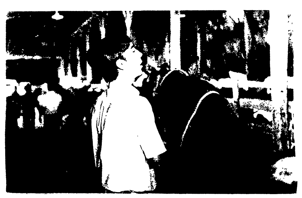
Leaving New Holland Sales Stables with a brand new purchase, a buyer stretches to