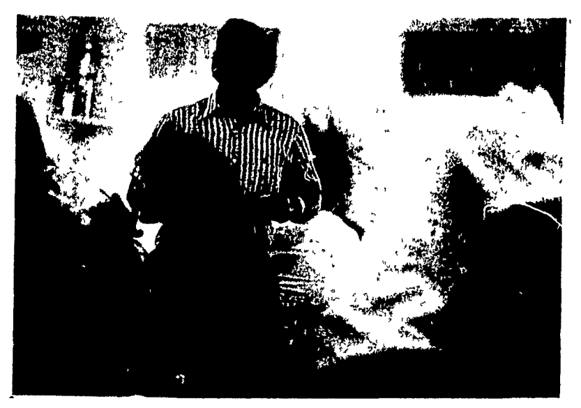
The restaurant at the Stables is a favorite gathering place for auction day buyers and browsers.