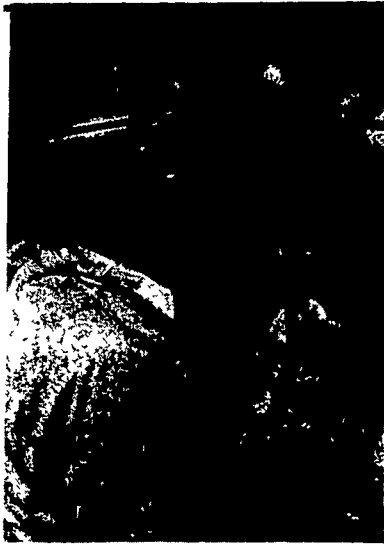
"You bought 'im for $300 . . . what do you mean you were scratching your ear?"

Part of the Monday morning ritual at the New Holland Sales Stables is to hitch up the trotters and let 'em go.