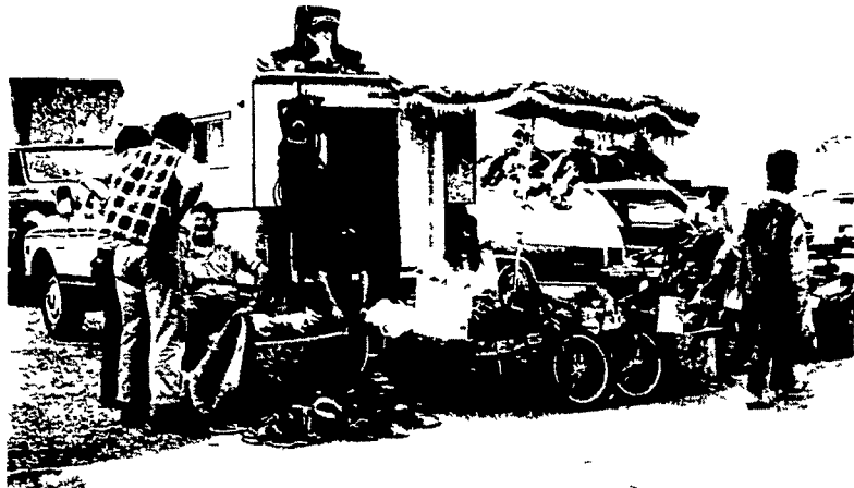
Sulky wheels, saddles, stirrups, spurs, bridles, bells and harnesses. If a horse can use it, you can buy it at this traveling tack shop every Monday at the New Holland Sales Stables.