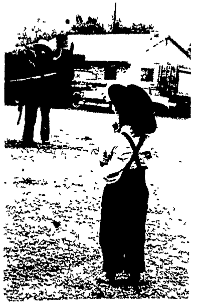
By the time this young fellow is old enough to buy his own horse, he's sure to know what he's looking for.