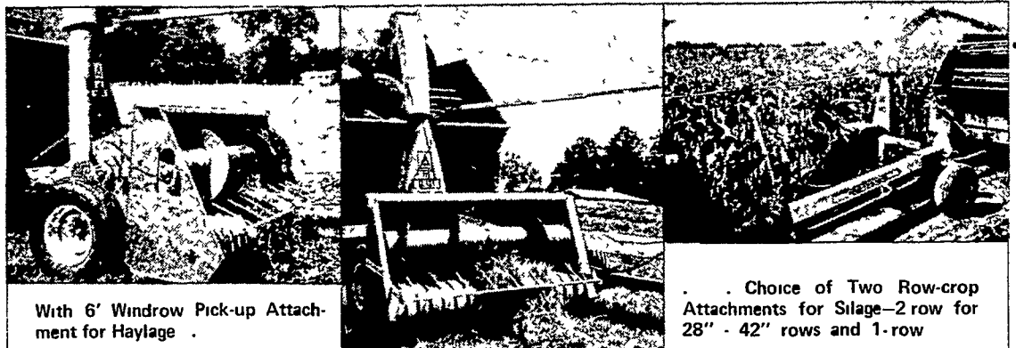
With 6' Windrow Pick-up Attachment for Haylage .