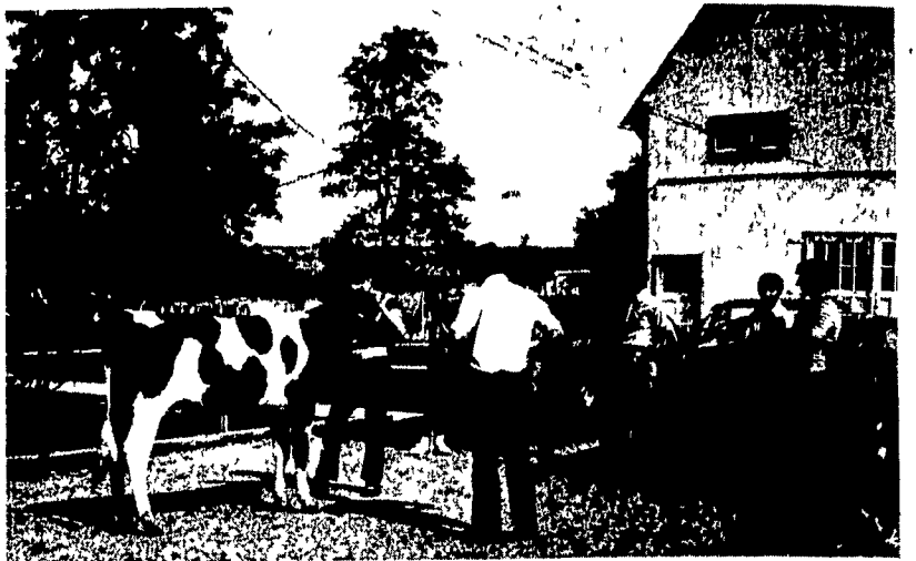
One of the successes of showing an animal at local fairs is the proper stance, both for the animal and for the showman. These FFA members are observing procedures under the direction of Clifford Day, Grassland FFA advisor, standing in the foreground.