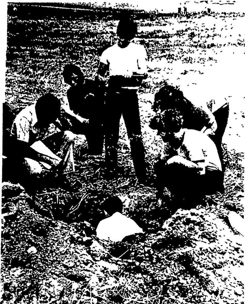
Contestants gathered 'round a hole, vying for honors in the land judging contest held as part of Tuesday's Conservation Field Days.