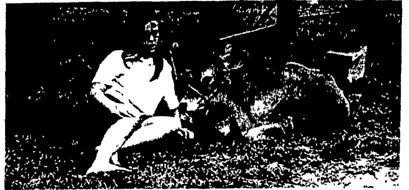
A young lady and friend, snatched a moment's rest Tuesday morning at the Guernsey Sale Pavilion. They were waiting for the start of judging in the annual 4-H Dairy Show.