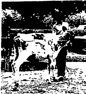
Early Tuesday morning, kids and calves alike were preparing for judging at the 4-H Dairy Show.