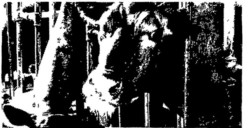
It's New from Wayne Research

32% DAIRY KRUMS plus your grain for Top Dairy Nutrition