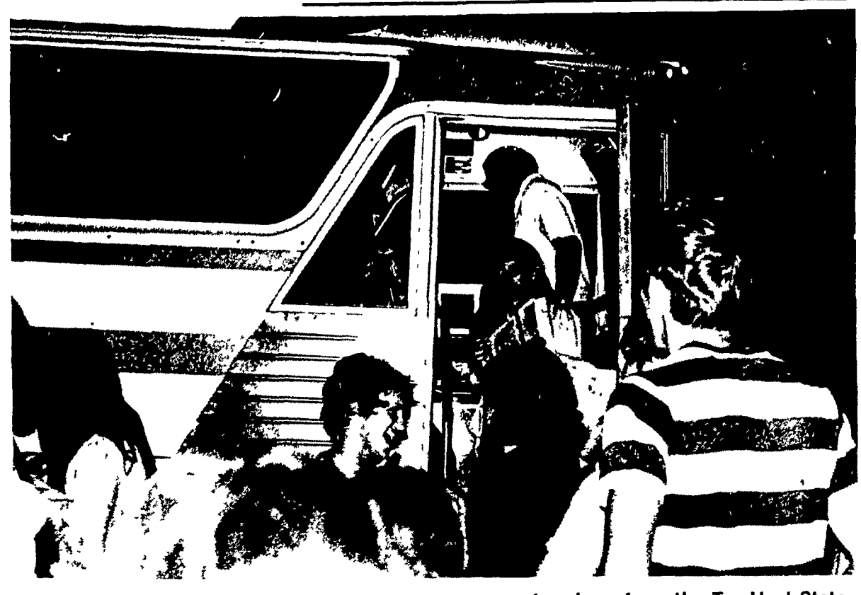
Lancaster Farming, Saturday, July 15, 1972–27

sold Thursday evening. Can be seen during store hours.