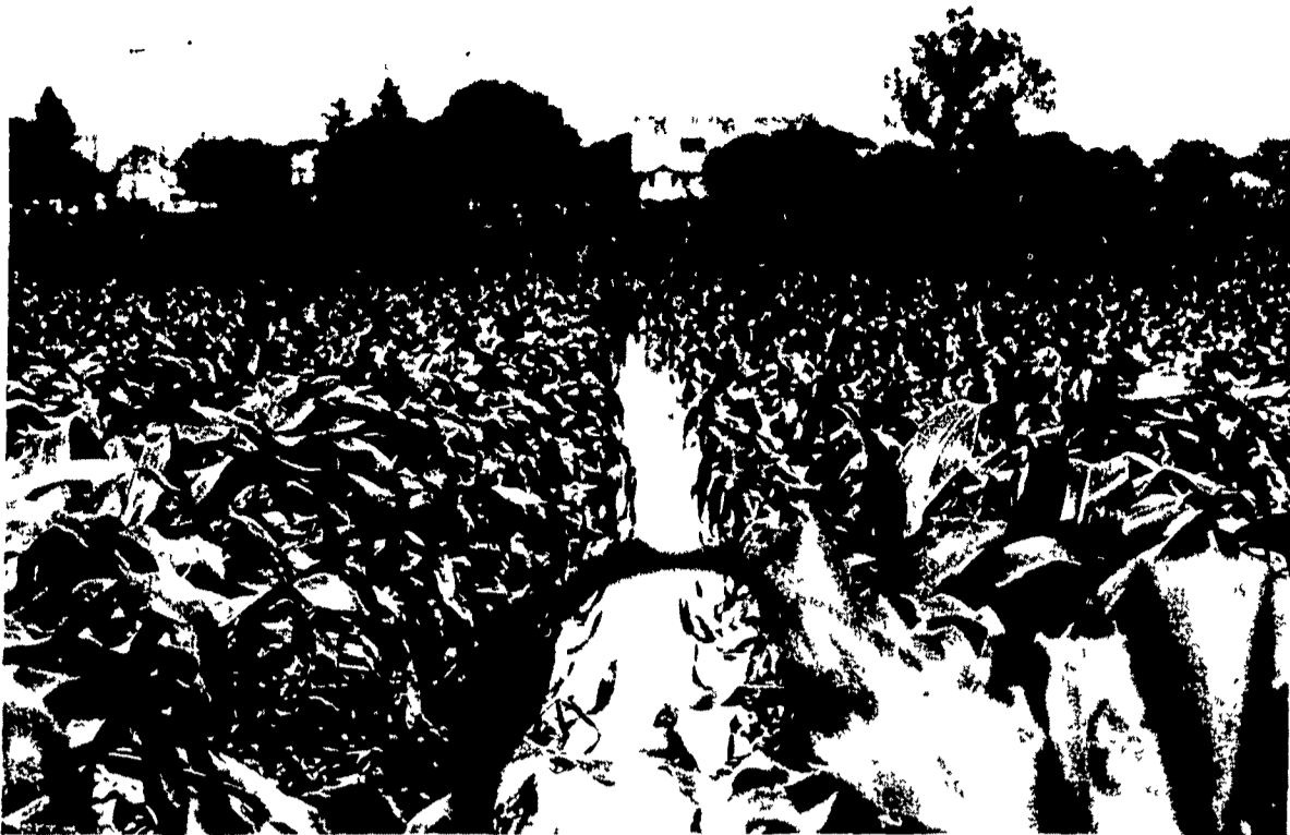
Water was standing in a lot of fields this week. The corn field here is near Stevens.