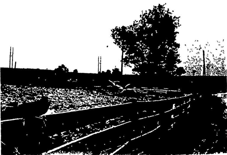
At the height of the flood, this cattle yard fence was underwater. The tree in the middle floated there.

Vacation time is drawing near, and for many persons that means long, high-speed trips in the family car. The Portland, Oregon, Traffic Safety Commission urges all drivers to have their car safety checked now for summer driving. Make sure the brakes, tires and lights are in safe condition.