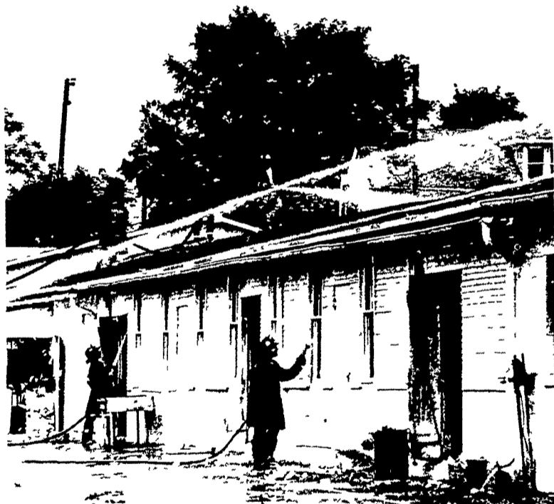
Attempts to save at least part of the main building at Root's Market and Auction failed. One fireman called it the hottest fire he'd ever experienced.