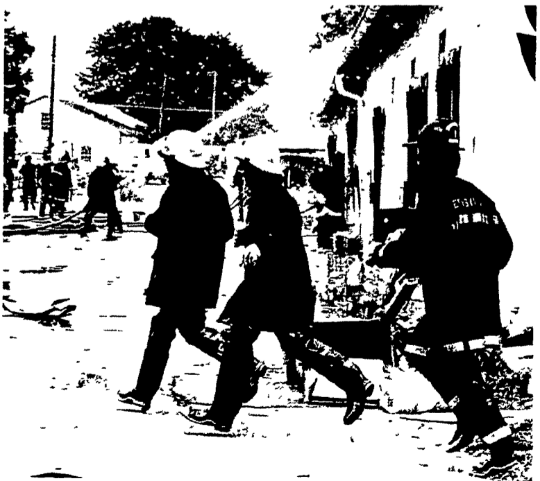
Firemen raced to their duty assignments at the fire which destroyed Root's Auction this week.