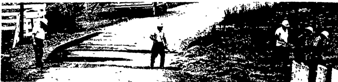
Road crews were busy all over the county last week repairing rural roads.