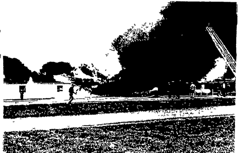
Flames raced uncontrollably through the main building at Root's Country Market and Auction.

Abram Root, owner of the auction, was unable to determine the exact amount of the damage. He said the Auction will be open for business as usual on Tuesday, July 4, if the weather is favorable. Tables will be set up outside to accommodate standholders and customers.