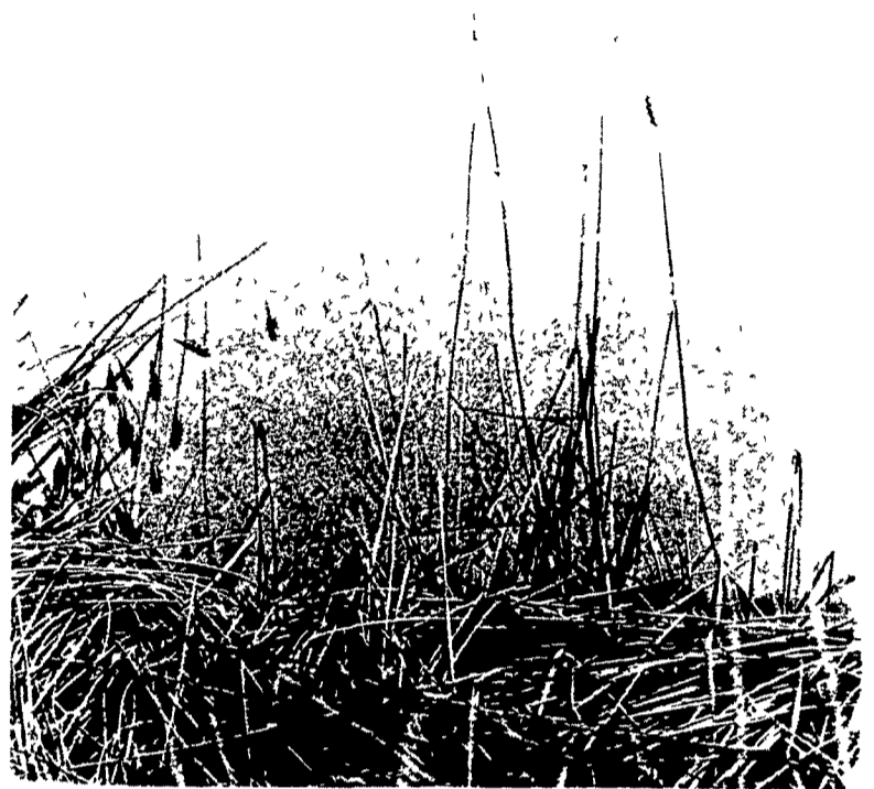
Barley was one of the crops hit worst by the rains of Agnes. Some farms may lose the entire crop.