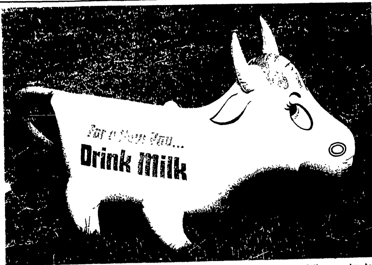
June is dairy month. Promotional tools like this blow-up cow are being used by

dairy associations around the country to promote the use of milk and milk products.