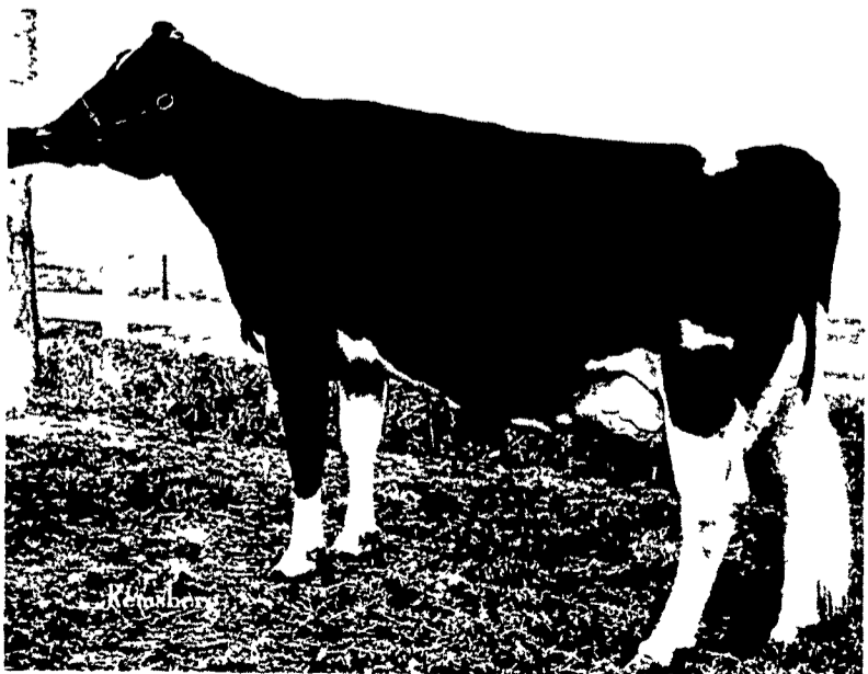
"Blossomelle Dairy Princess," seven-year-old registered-Holstein who won All-Pennsylvania award last year.