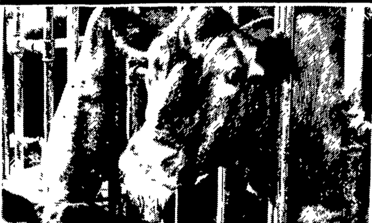
It's New from Wayne Research

Guam, which lies farther west than any other U. S. territory, is often called the place "where America's day begins." This tiny island is first to greet the dawn of each new day because it lies beyond the International Date Line.