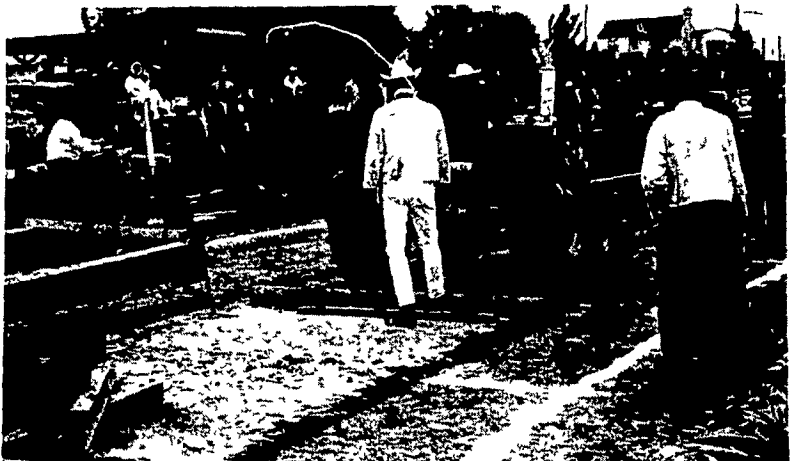
This was part of the action Saturday at Rough and Tumble Saturday at the first tractor pull of the season. A large crowd of onlookers enjoyed the days event.