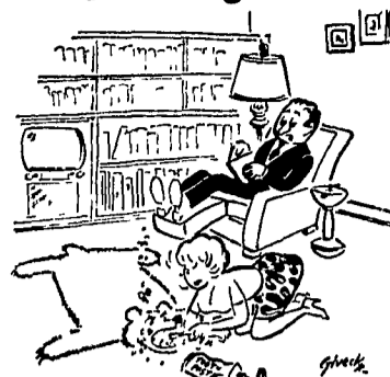
"Alice, must you be that thorough?"