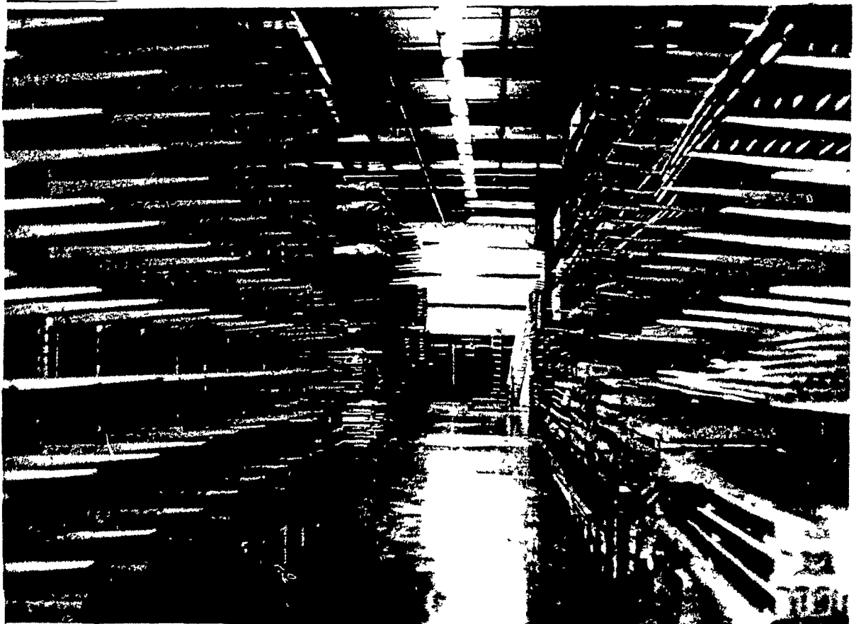
Agway's ultra-modern distribution center features cantilever shelves for long, hard to stock items such as pipe.