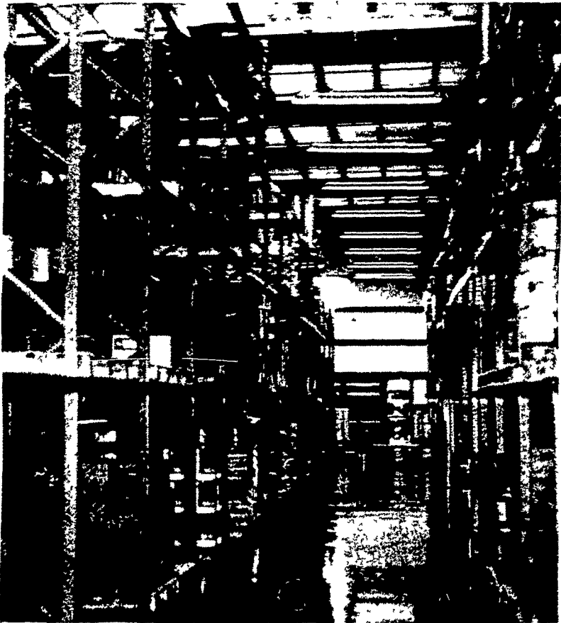
Items which are in demand are stocked on pallets on shelves and a towmotor is used to load stock and remove stock from the shelves.

distribution center so that items can be pulled from stock easily and quickly.