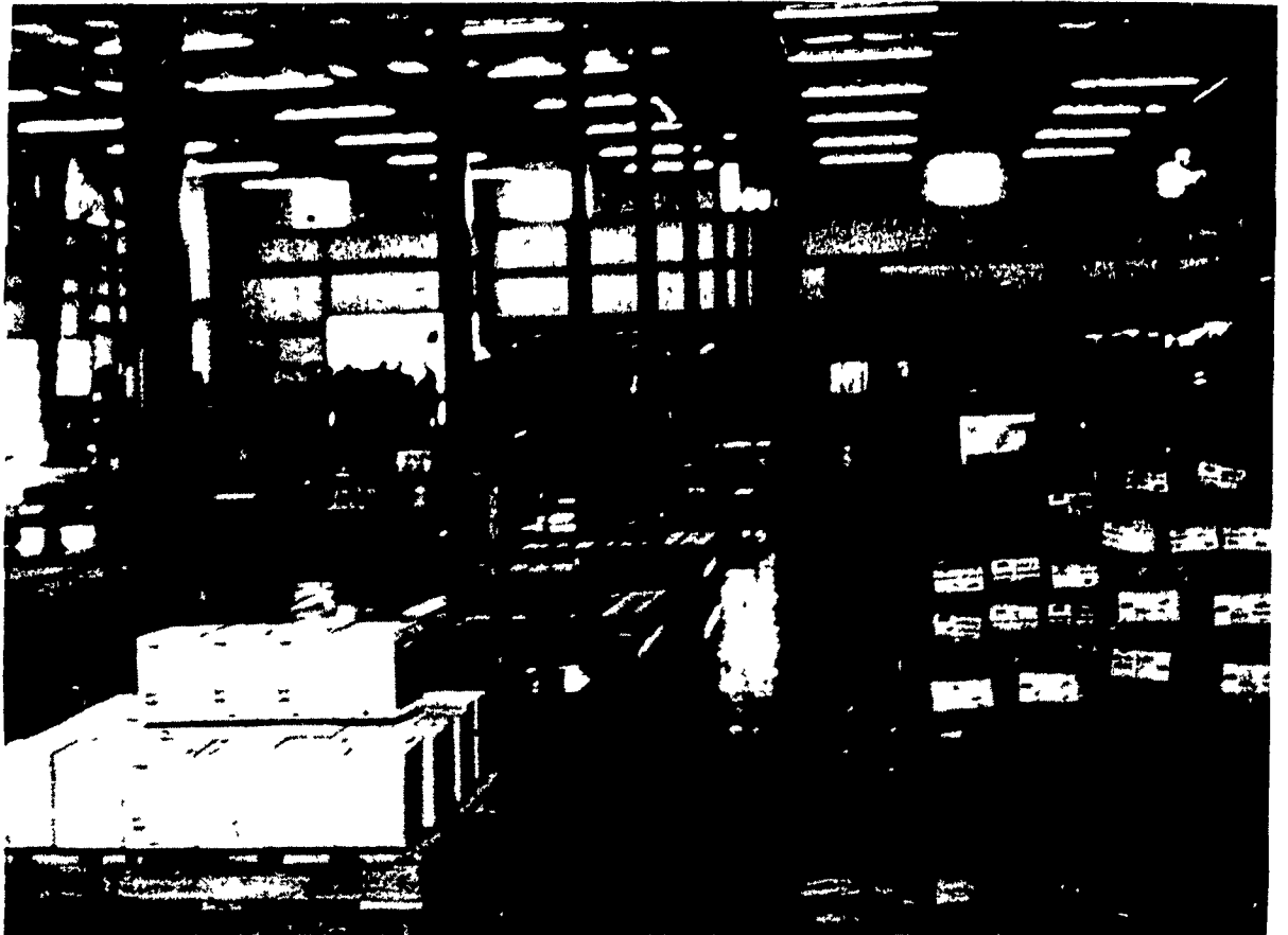
These trucks run on a chain driven belt in a continuous circle around the