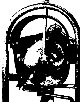
Safety covers not shown