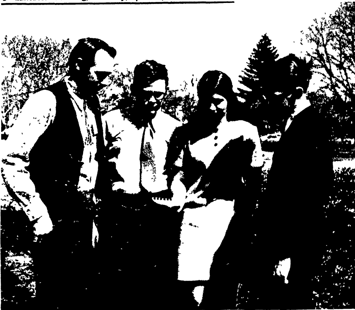
Among Chester Countians who attended the 4-H Teen Agricultural Leadership Conference in Washington, D.C. are discussing the conference program.