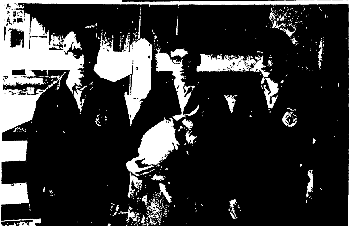
A gilt chain is one of the on-going awards at the Manor FFA Chapter. A gilt is presented to a deserving FFA member, who in turn presents a gilt out of the first