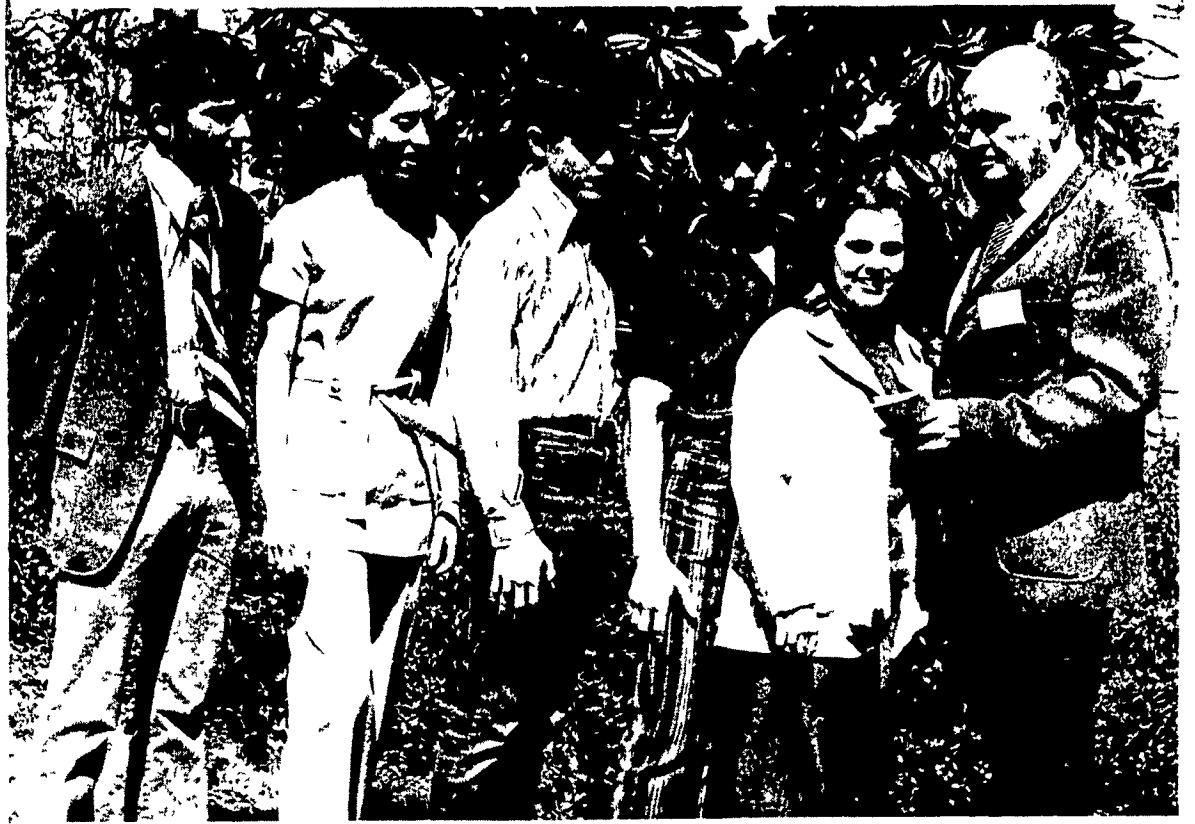
Approximately 150 4-H members from the Commonwealth took part in the Northeast States Invitation 4-H Teen Agricultural Leadership Conference in Washington, C.D. Atlantic Breeders Cooperative scholarship winners attending the conference at the National 4-H Center

Some 700 Hereford and Polled Hereford breeders and enthusiasts from all over the world attended this sixth World Hereford Conference in South Africa making this the largest influx of foreign visitors for any meeting in South Africa's history. The seventh World Hereford Conference, four years hence in 1976, will be held in Canada.