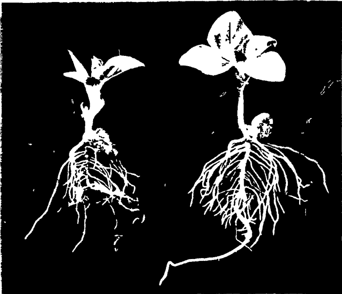
The root systems of the two plants

BROAD BEAN PLANTS, above, show growth stimulation (right) from use of SEA-BORN over control plan (left) not fertilized with SEA BORN. Plant supplement and Leaf Spray.