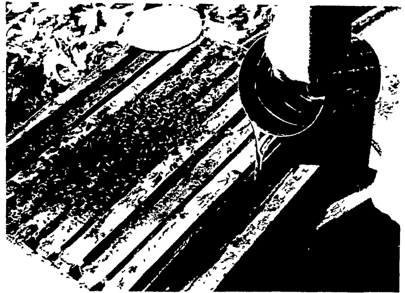
Shank feeds the bees a mixture of sugar and water to tide them over the winter.

for pollination. Some farmers rent bees for a short period of time from local beekeepers. I wish more farmers had their own. But I guess they're busy enough," he laughed.