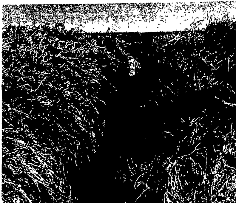
The water comes off of the sod waterway and down this corrugated drain pipe into the stream. Thus the water is drained gradually without eroding the soil.