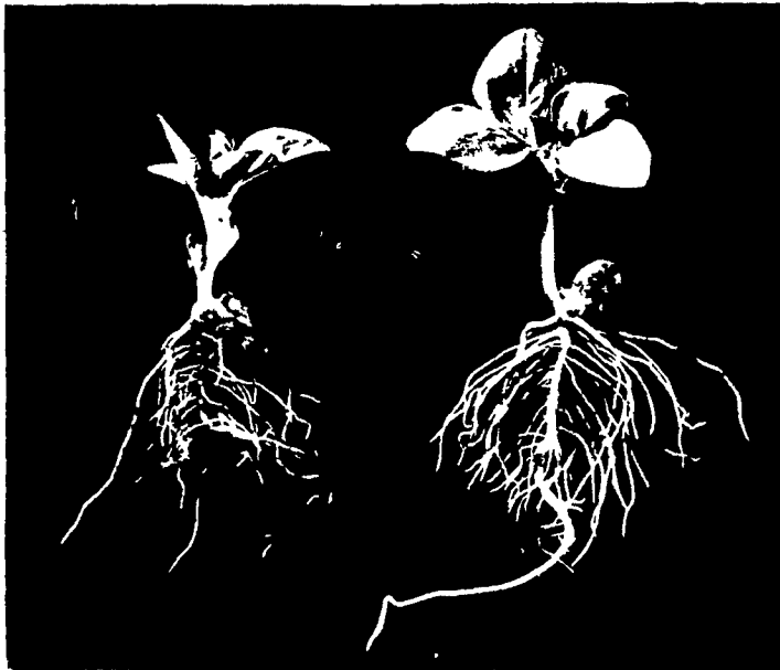
The root systems of the two plants.

BROAD BEAN PLANTS, above, show growth stimulation (right) from use of SEA-BORN over control plan (left) not fertilized with SEA BORN. Plant supplement and Leaf Spray.