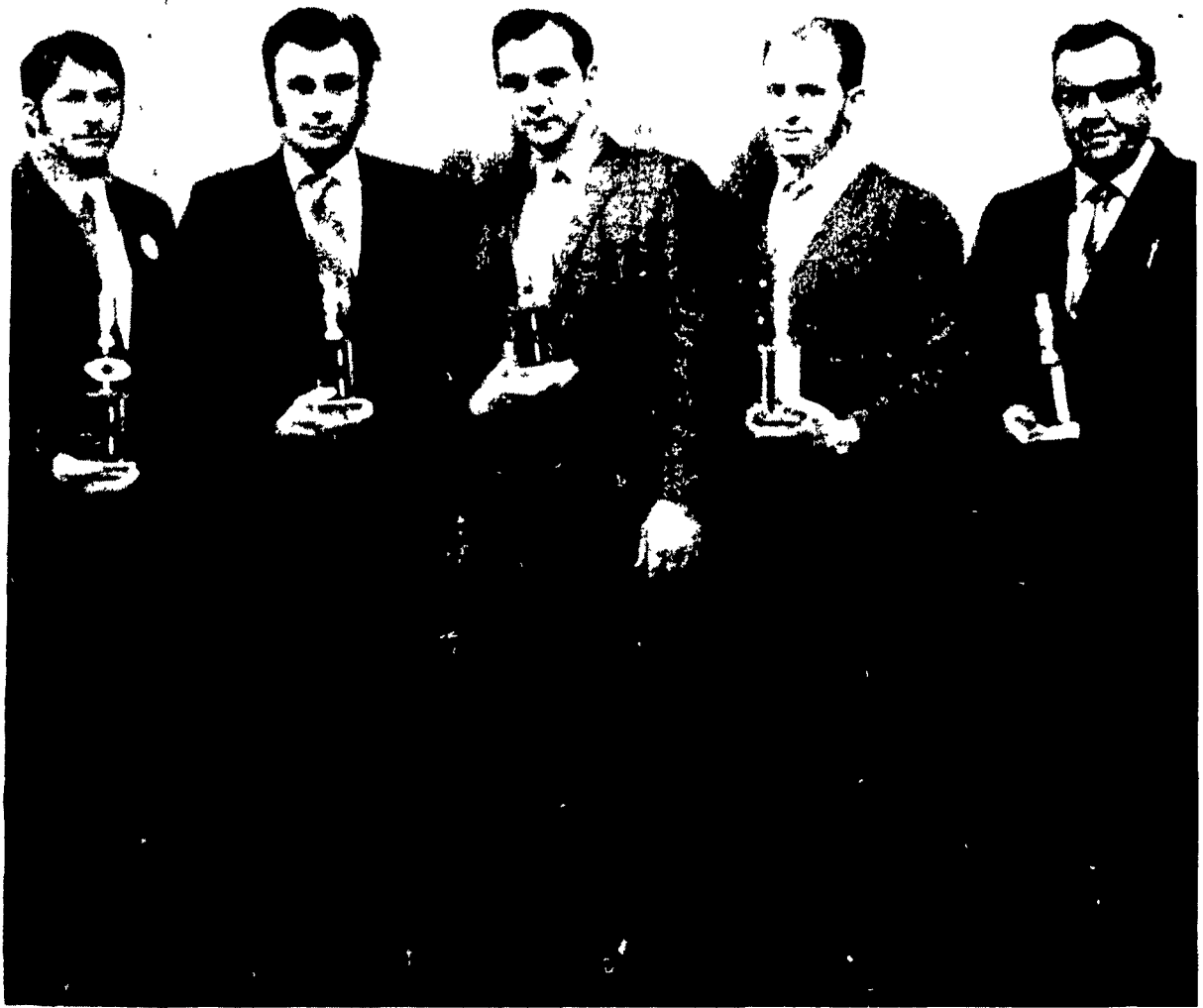
High corn silage awards were given to the following Octorara Young Farmers at the recent banquet at the Octorara High