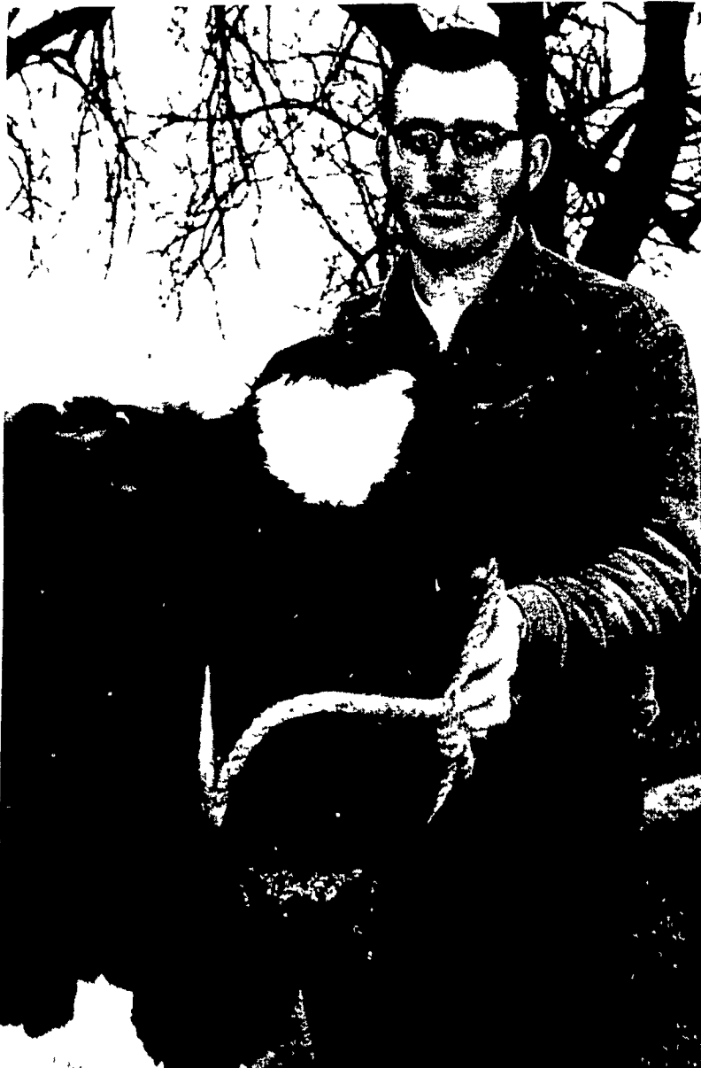
While Wenger's 67 milking Holsteins represent a relatively large herd and most of them have never been led, this older cow is among a few that he entered in judging events in past years.