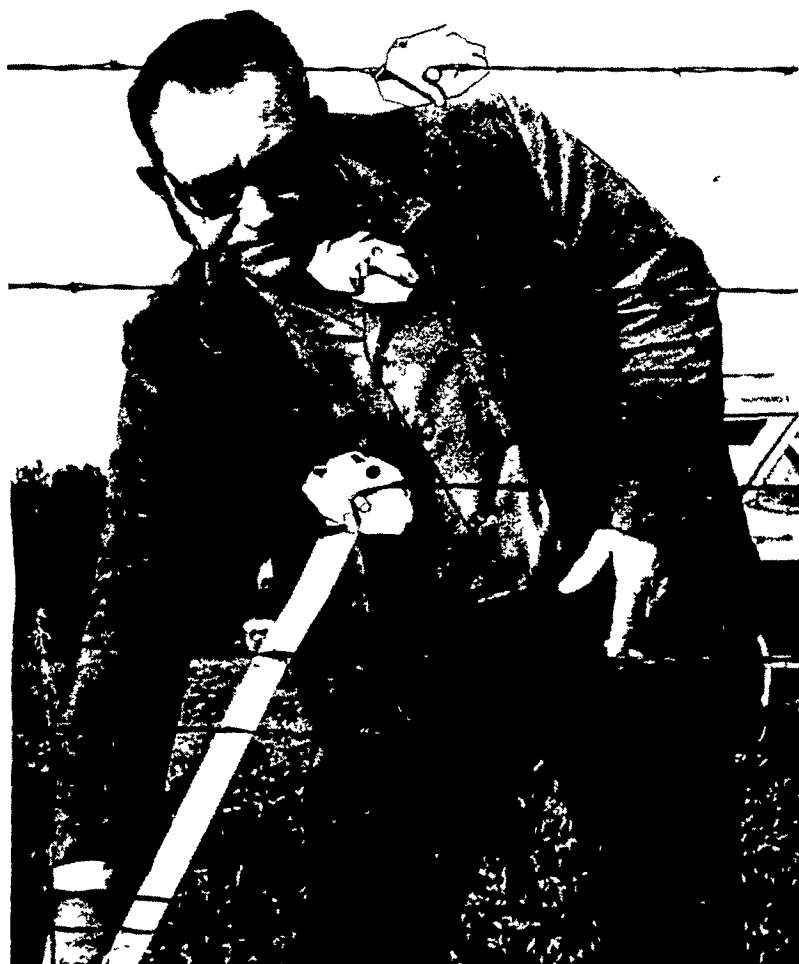
This man shows you can forget the fence crew and do it all quite easily yourself if you have the right equipment.