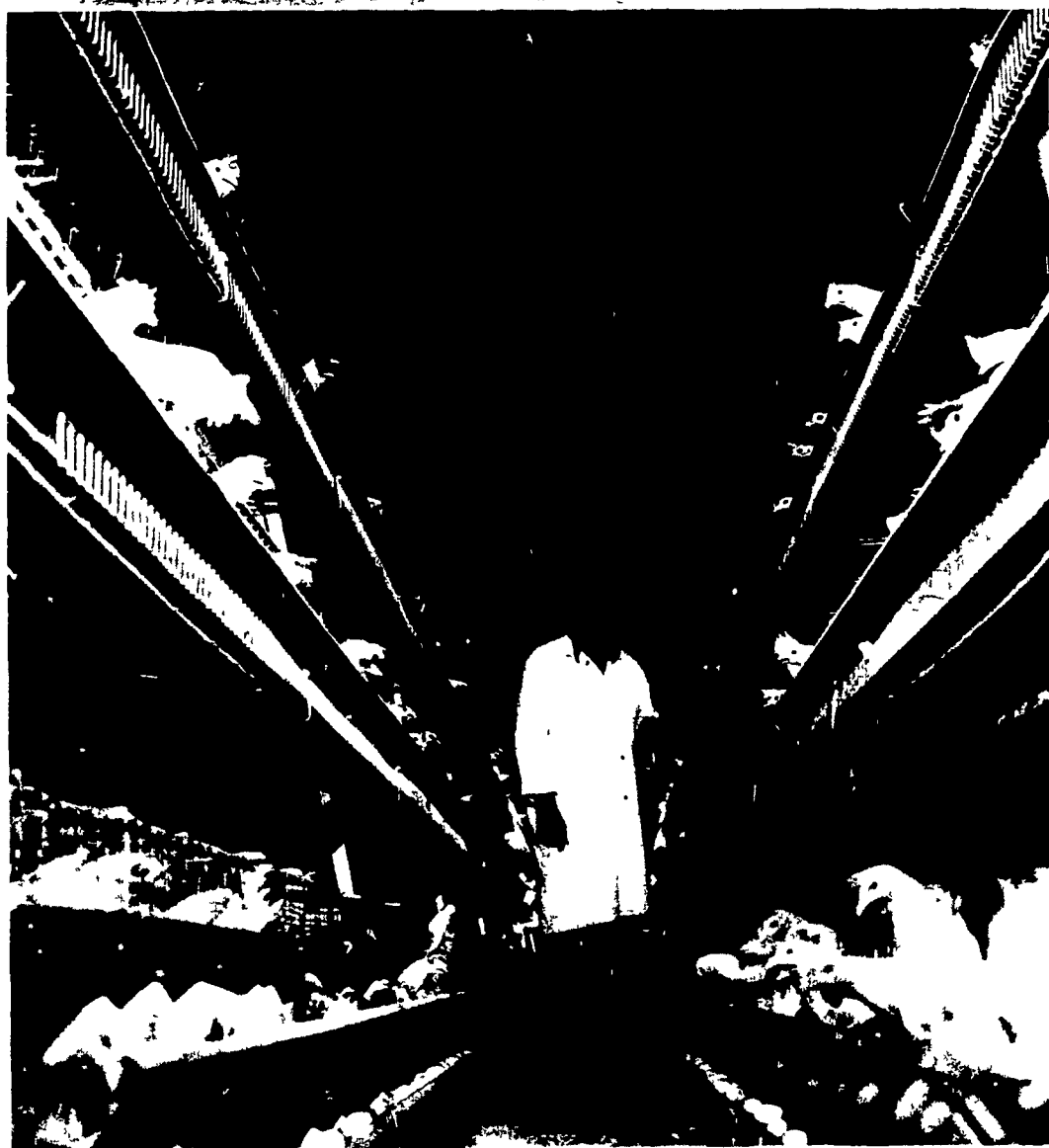
TRI-DECK IS THE MULTIPLE TIER CAGE SYSTEM WITH PROVEN PRODUCTION FEATURES

Estimated daily livestock slaughter under Federal Inspection.