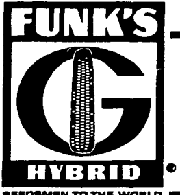
Dependable Hybrids from Dependable People

Funks is a Brand Name Numbers Identify Varieties Funk Bros Seed Co