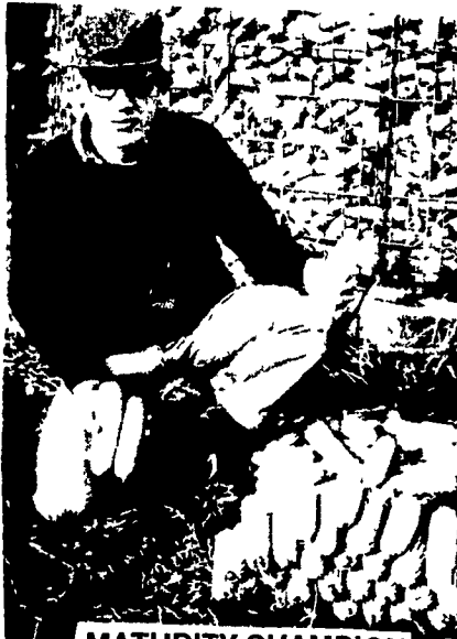
MATURITY CHAMPION 200 BU. ACRE MUNCY CHIEF SX662

2ND PLACE PA. 5 ACRE CONTEST VENANGO COUNTY CHAMPIONS 188 BU. SHELLED CORN TO THE ACRE MACHINE HARVEST MUNCY-CHIEF SX662