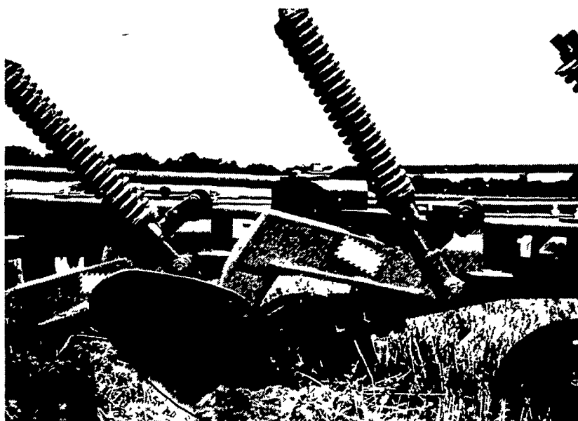
EXHIBIT No's 54-61

See all that's new in Ford Blue. All built to make your farm work go faster and easier. Make the Ford exhibit one of your first stops at the 1972 Pennsylvania Farm Show. Then stop in and see us.